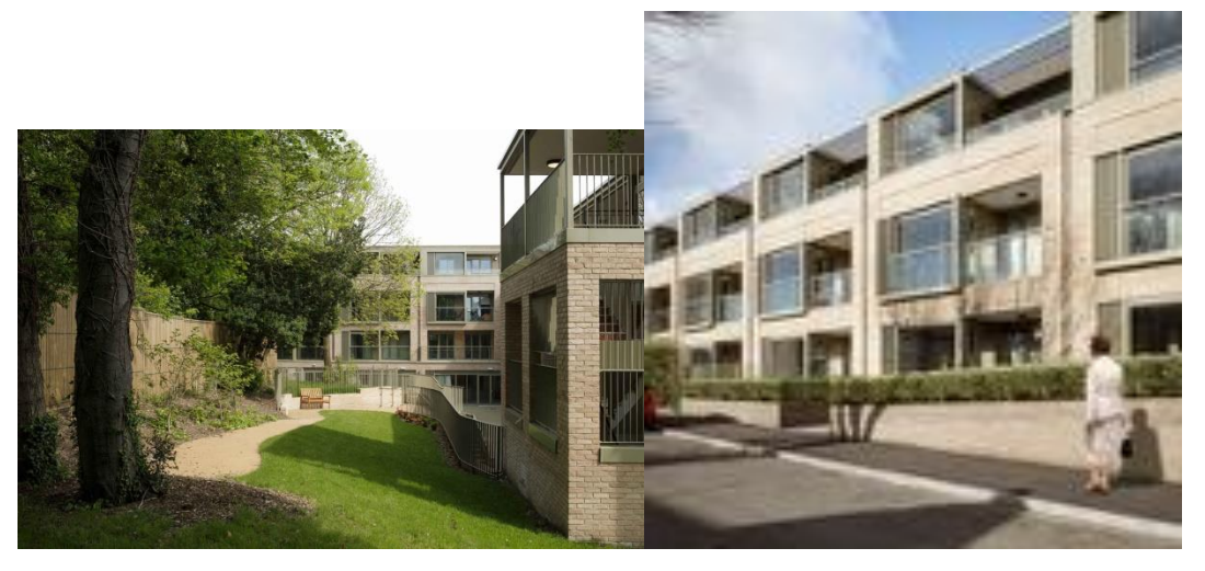
Windmill Court Extra Care Scheme