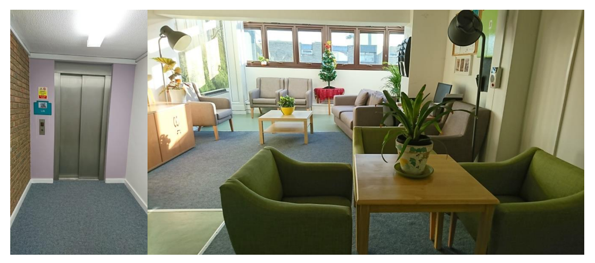
Kevan House - lift and hallway