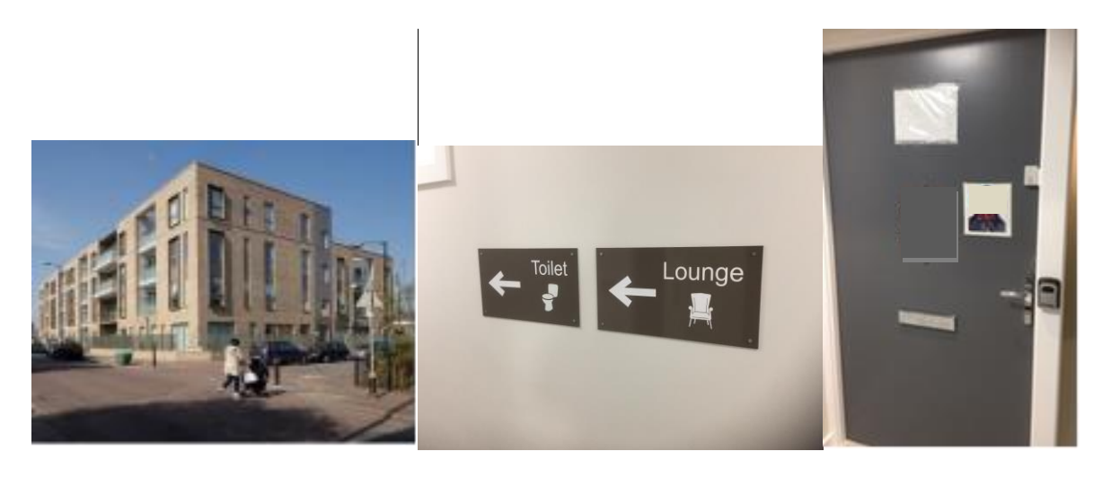
Tayo Situ House: external view and examples of visual signage and prompts to support residents with dementia

Tayo Situ House in the borough of Southwark, forms part of the Council's pledge to become an age-friendly borough. Its housing strategy includes building 1,500 new council homes by 2018. A new Day Centre is being built next door to the scheme and due for completion later this year. The development comprises 42 apartments, built to accreditation standards set by Stirling University's Centre for Dementia Care. The scheme was visited in November 2017, by Health Sub-Committee Chair, Councillor Michael Borio.